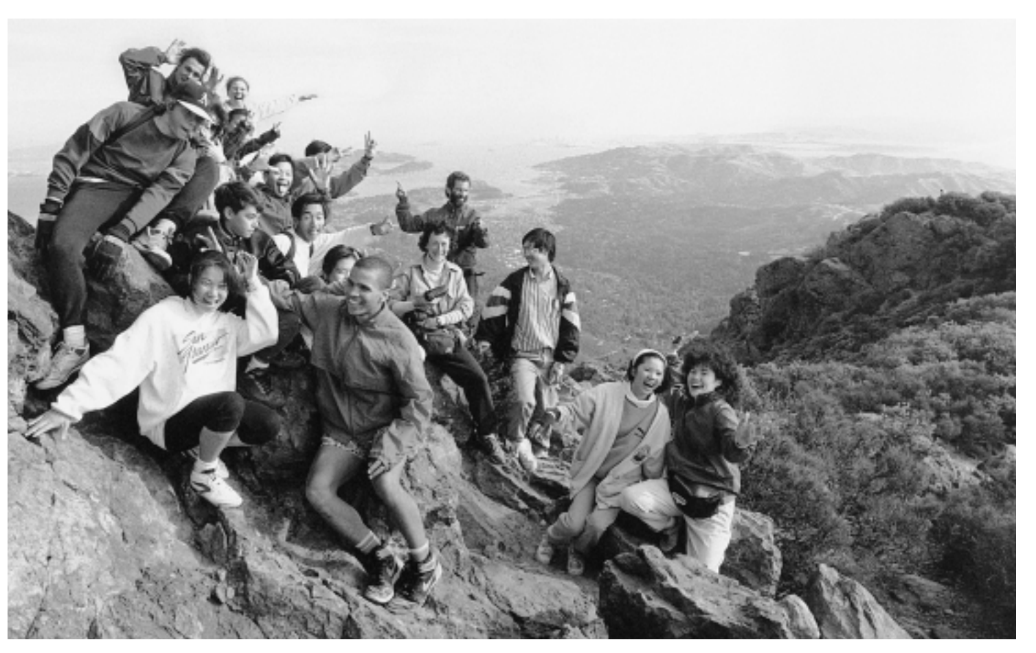
Nonprofits that take kids on outings—like Trips for Kids of Mill Valley—can look very "risky" to commercial insurance companies.

Enormous credit goes to the initial six foundations and others who contributed start-up support to NIAC. Even though the funders carefully researched this model project, it was a high-risk investment. NIAC was a start-up company planning to offer a complex financial product that the commercial industry sector was unwilling or unable to provide for many nonprofits. To complicate matters, they were going to establish this model in the most litigious state in the nation. Risky as this endeavor was, the funders concluded that the risk of doing nothing was greater.